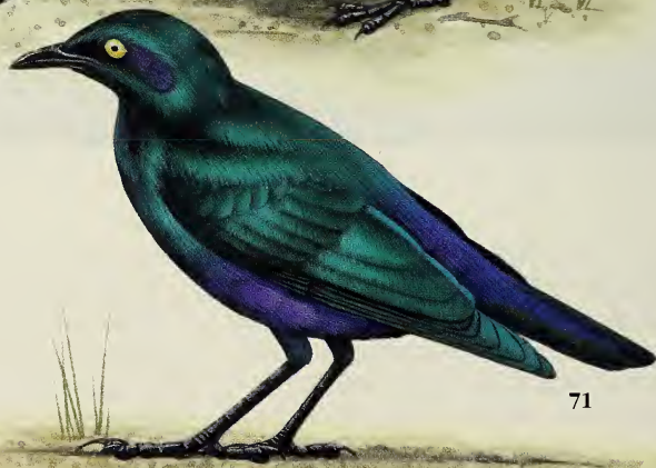
Plate 1. 68: Cape Glossy Starling Lamprotornis nitens . 69: Greater Blue-eared Glossy Starling Lamprotornis chalybaeus . 70: Lesser Blue-eared Glossy Starling Lamprotornis chloropterus (a = adult, b = juvenile). 71: Bronze-tailed Glossy Starling Lamprotornis chalcurus .